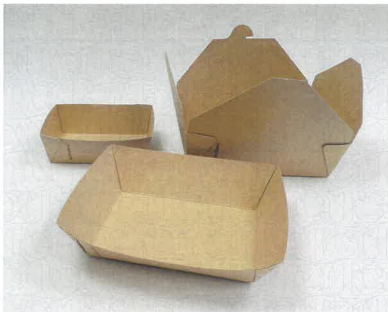
Fig. No. 1: Disposable ecological packaging „ecofoodbox“